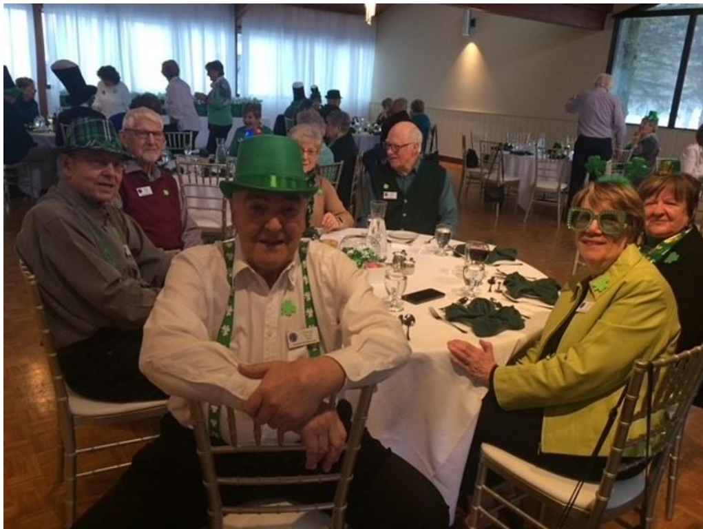
Some of the Oshawa group that attended Port Perry celebration of St Patrick's Day