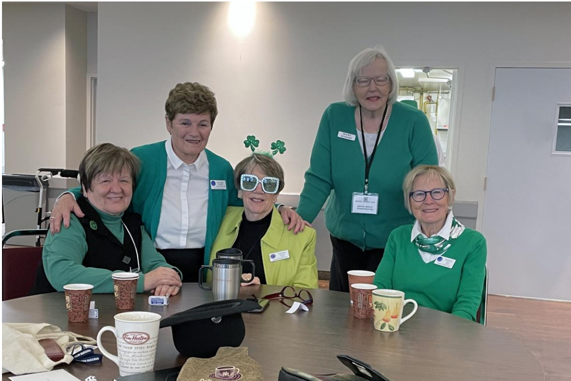
Some St. Patrick's Day enthusiasts attending our March meeting.