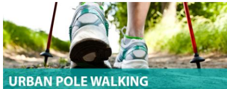
URBAN POLE WALKING