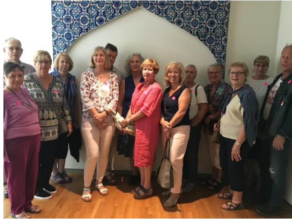
Aga Khan Museum