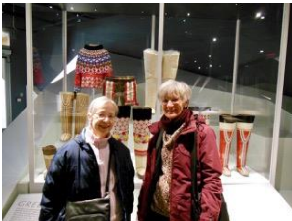
Bata Shoe Museum